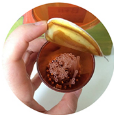
Traditional iodophor swab

After opening, it is easy to run iodine, and the longer the time, the weaker the disinfection effect.