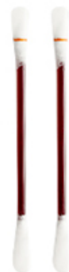
Providone Iodine Swabs