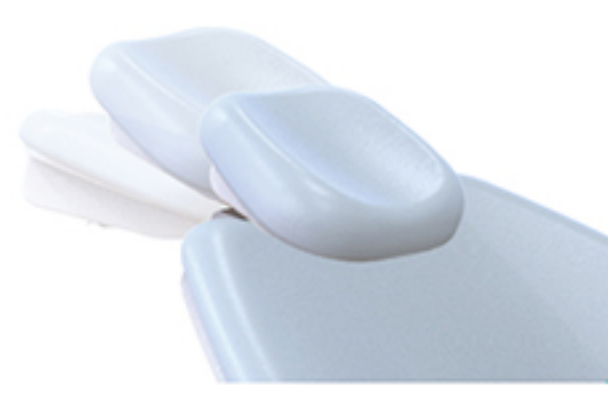
Rotary folding headrest