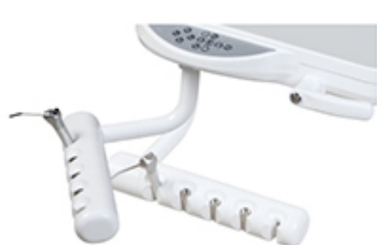
Rotary folding headrest