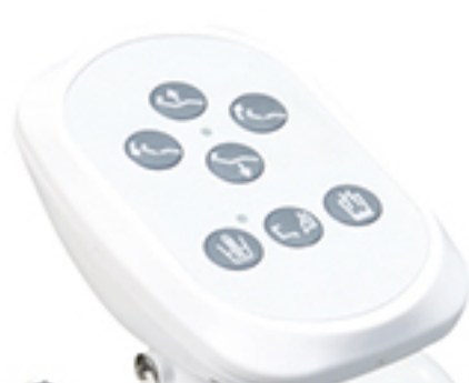
Rotary key type sub control panel