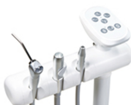
Rotary assistant stand