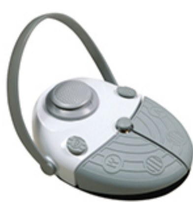
New multi-function pedal