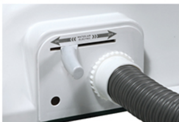
One key main switch for water-air-electric