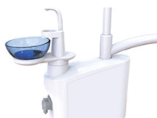
Rotating unit box