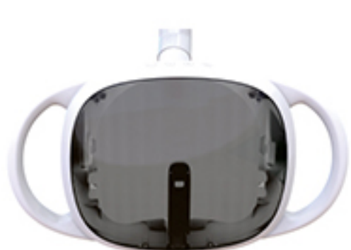
LED reflector lamp